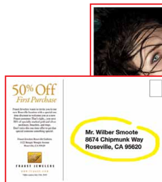
Variable Data at full speed